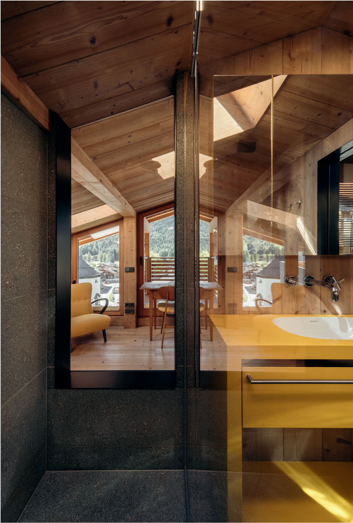
To the side, the main bathroom featuring a transparent glass panel at the position of the shower cabin, to offer a view of the panorama outside. Duravit washbasin, Zazzeri faucets. Facing page: above, the overall volume that contains the en suite bathroom, clad in HPL laminate produced by Arpa in chanterelle yellow. Below, the custom bed designed by Lazzarini Pickering Architetti, framed at the sides by two skylights. Moessmer fabrics, Brunico. Wood floors in brushed and lightened larch.